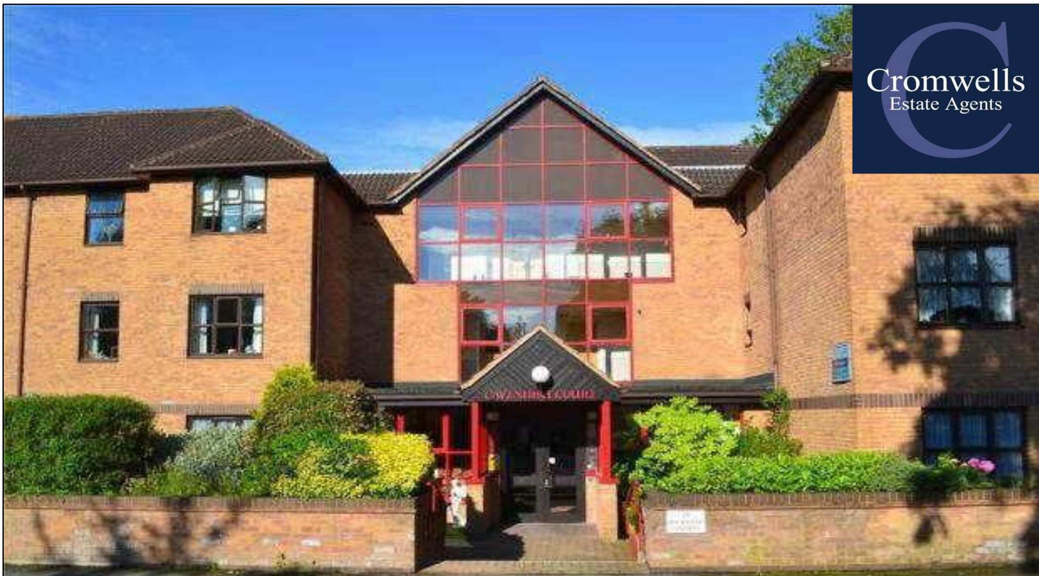
Cavendish Court, 15 Holmwood Gardens, Wallington, Surrey, Guide Price £110,000

A completely refurbished and beautifully presented one bedroom ground floor apartment, forming part of this select retirement development. The property benefits from a re modelled kitchen and bathroom and is situated in a quiet, yet, convenient location, close to Wallington town centre and train station.